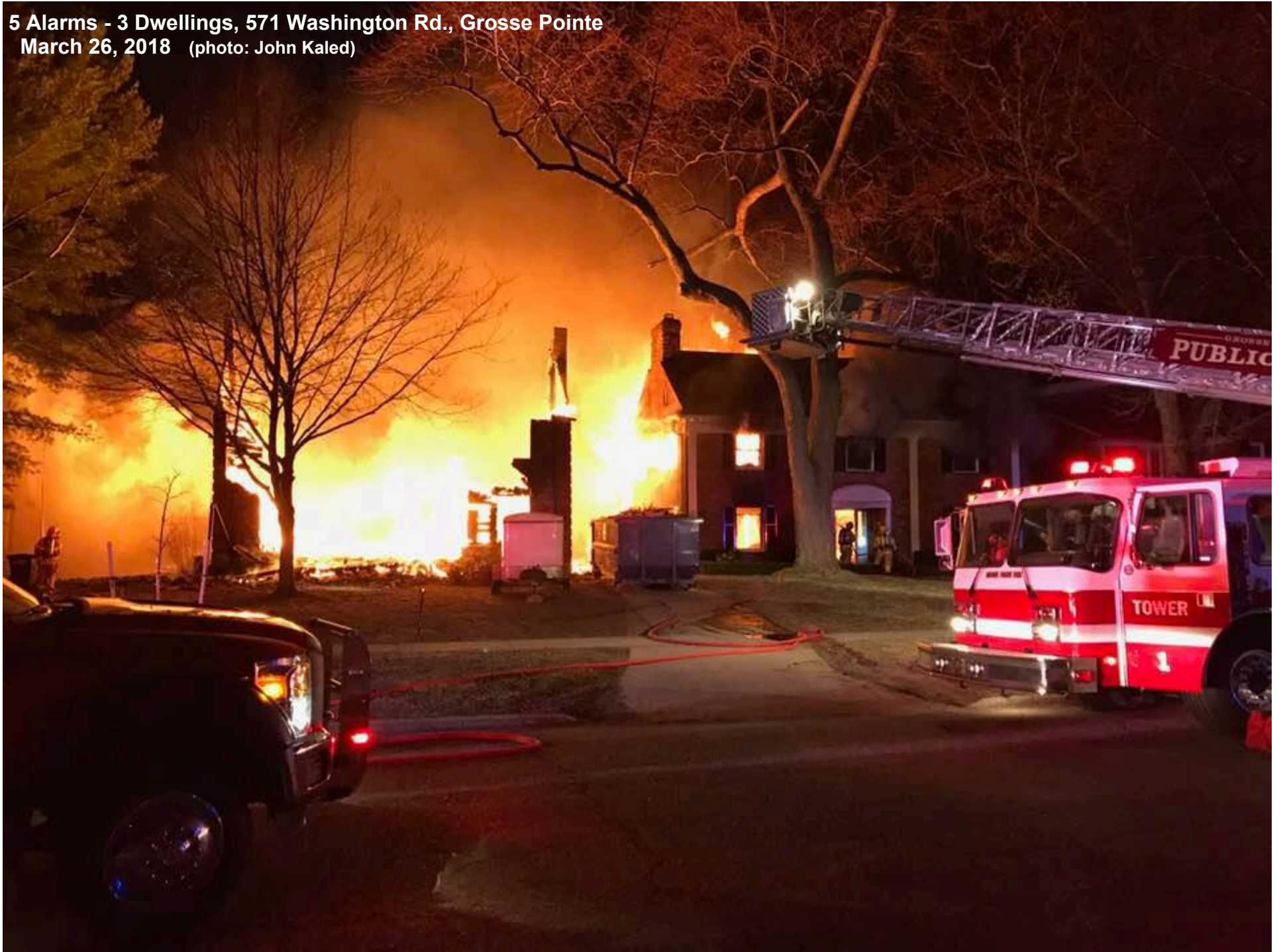
5 Alarms - 3 Dwellings, 571 Washington Rd., Grosse Pointe March 26, 2018