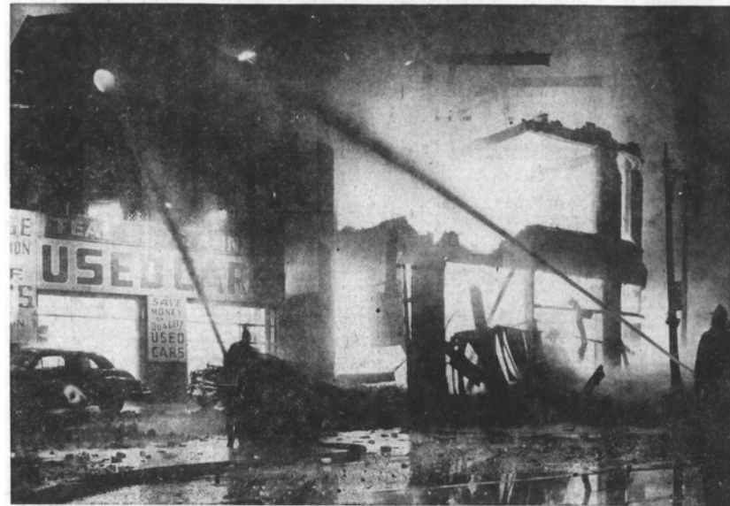
Firemen play tons of water on $250,000 blaze on Gratiot at Baldwin