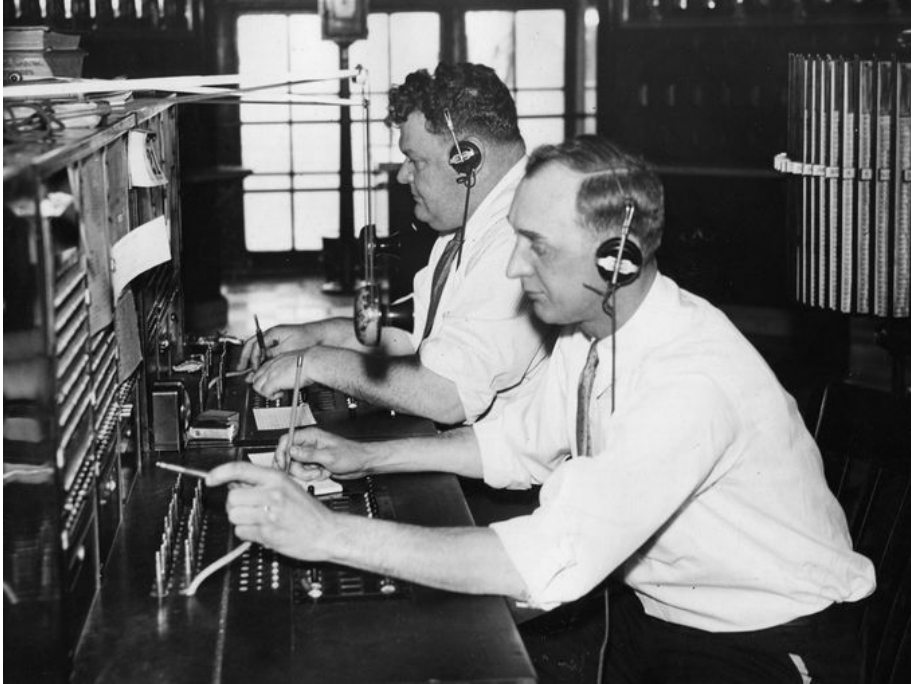
Detroit Fire dispatch operators - 1933