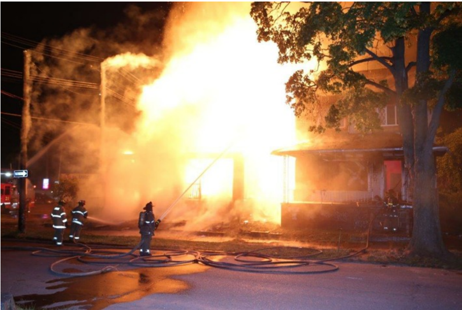
Below left and right: A 'working fire in a dwelling' at Sharon & Vernor 6/21/2014