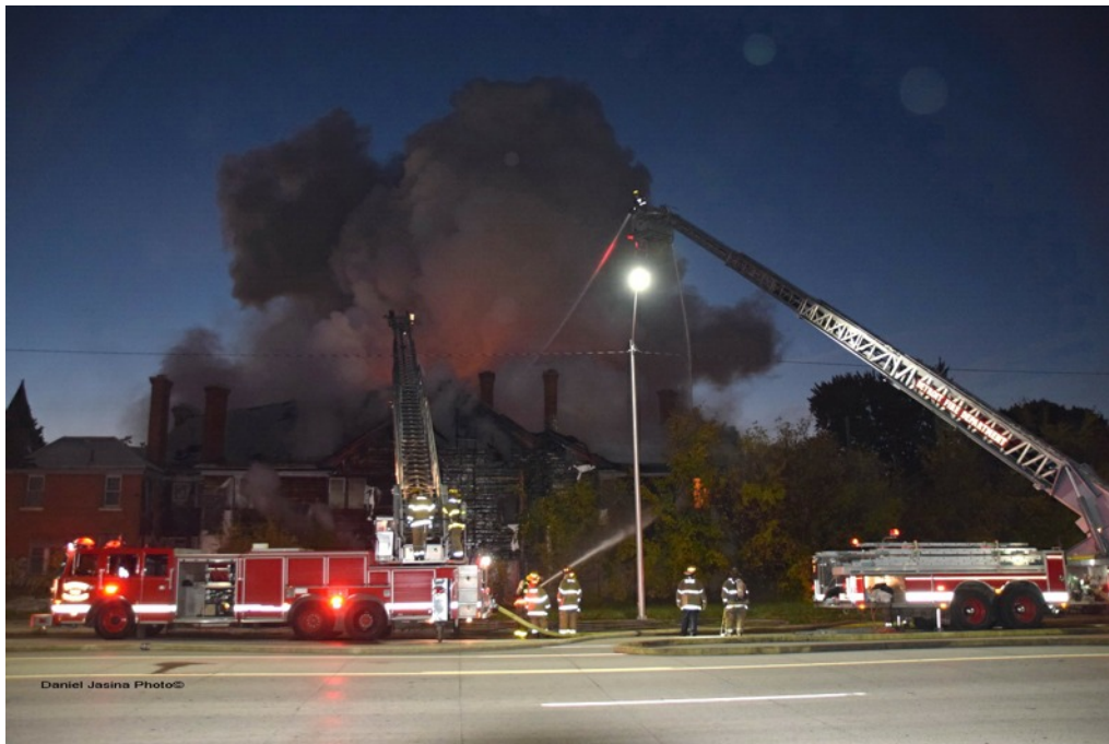
Left:: 2nd alarm, Seneca at Gratiot, 10/25/2016