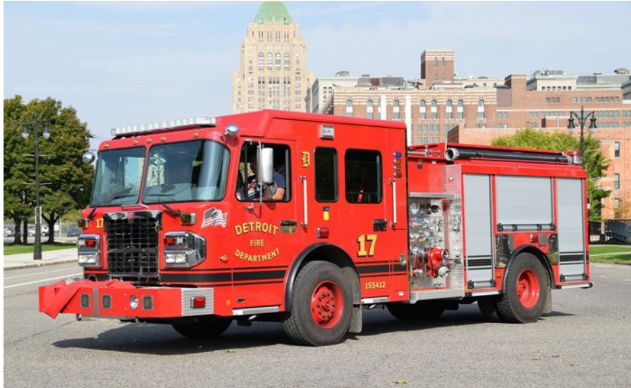
Engine 17's new rig