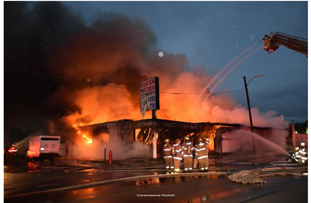
2nd alarm, E. Eight Mile at Sunset, 10/21/2016