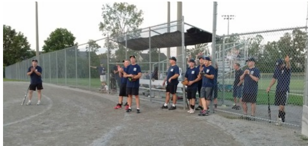
The Troy Volunteers

Now the largest fire department in Oakland County, and the largest volunteer-combination department in the state, the department operates out of six stations and utilizes six engines with two in reserve, six trucks including three platforms, a rescue