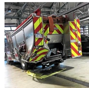
Taylor Engine 2

WDIV ran this report on the incident. To see it (2:00) [click here] .