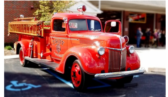
Troy FD's show piece: a 1940 Ford